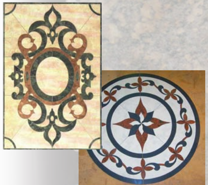
Unique, ornamental stone floor inlays produced and cut out on the TECHNI Waterjet™ Intec® 612 .